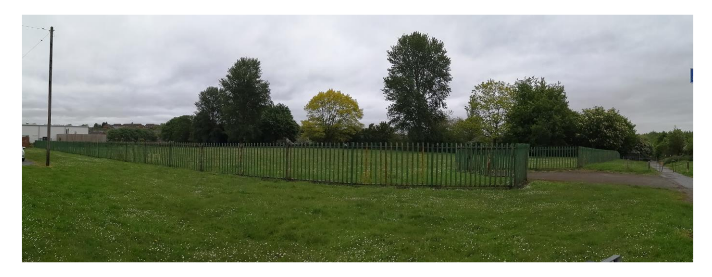
View from south west corner of site (from Market Cl/Sookholme Rd junction – rear of Lidl store to the left of the image)

The application site is an area of approximately 1.2 ha of mainly grassed parkland that contains the remnants of now disused play equipment on a hard surfaced area located to its north western corner; the site is mainly bounded by metal railings. It is located on the edge of the town centre, to the south side of Portland Road in Shirebrook. Pedestrian access is available from both that highway and from Market Close to its west, with vehicular access (via a locked gate) provided from Sookholme Road to the site south western corner.